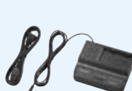
BC-U1 Battery Charger (1-slot)