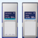
SBP-64A/32 SxS Pro Memory Card