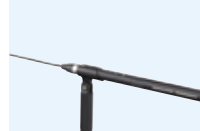
ECM-680S Stereo Microphone