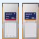
SBS-64G1A/SBS-32G1A SxS-1 Memory Card