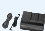
BC-U2 Battery Charger (2-slot)