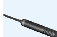
ECM-MS2 Stereo Microphone