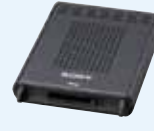
SBAC-US10 SxS Memory USB Reader/ Writer