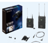
UWP-V1/V2 Wireless Microphone System